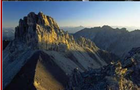
Queyras—an undiscovered alpine paradise

Why not discover the Queyras in the Southern Alps, with its diverse landscapes of alpine meadows, rocky deserts and rugged peaks. Accessible high mountain cols and summits make this sunny region a paradise for mountain walkers. Info Another new destination for 2009 is the Vanoise National Park in the Alps. A series of stunning walks of moderate/challenging difficulty skirt beneath soaring glaciated peaks, making this holiday ideal for those mountain walkers looking for a first alpine experience. Info Or, if you're looking for something more gentle, why not try the Tarn and Aveyron in south west France, where hundreds of historic hill-top towns overlook dramatic gorges. Info